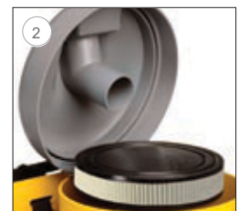
2. HEPA Cartridge filter