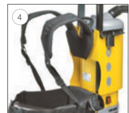
4. Accessory holders