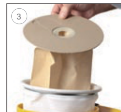
3. Paper filter bag